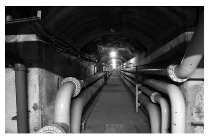
The cylindrical horizontal steel tanks at Has Saptan are connected to a series of underground tunnels housing the pipes connecting the tanks to Malta's ports.