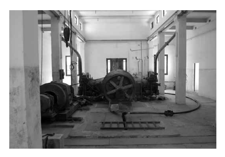
Volunteers recently restored to operating condition the engine at the 1935 Wied il-Ghasel pumping station.