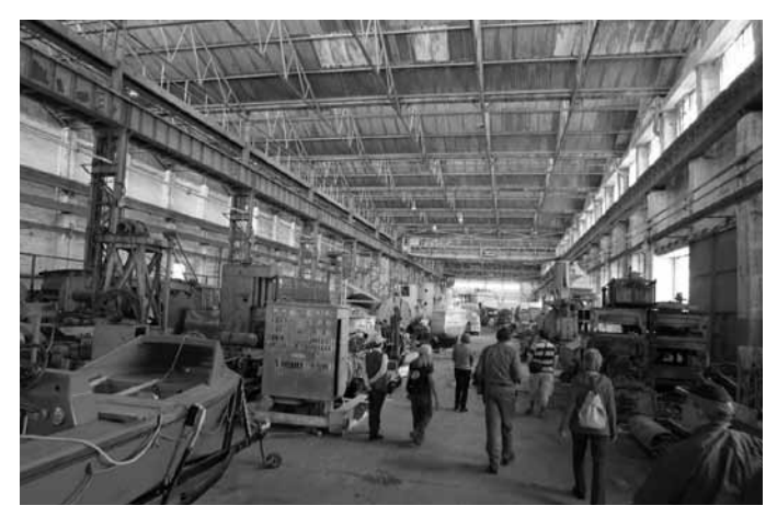
The Dockyard Boiler Shop is a steel-frame structure built by the British to replace an earlier stone shop destroyed during WWII. It now houses old buses and an assortment of machinery, most of it from the dockyards. Some day, some of these artifacts may find their way to display in a proposed industrial heritage museum.

Wednesday began with a cruise about the Grand Harbour, the largest natural harbor in the Mediterranean. We docked at Birgu, and then proceeded for a special visit to the home and offices of the Knights of St. John. This site is rarely open to tours, so we were honored to be admitted, and to enjoy the amazing views. The northeast side of the harbor is a series of deep inlets, so after lunch we made our way to the next inlet and the former Dockyard Boiler Shop, a cavernous building once used for the repair of the British navy's boilers. The shop is now being used to house a collection of large objects for a future National Industrial Heritage Museum. Two radial aircraft engines, salvaged from the sea and encrusted in calcium/salt deposits, were exemplary of the great deal of work that will be needed to prepare the objects for exhibition, but we all agreed that the boiler shop will make a very appropriate venue. We had a compressed visit to the National Maritime Museum, which traces Malta's maritime history from the 16th century when