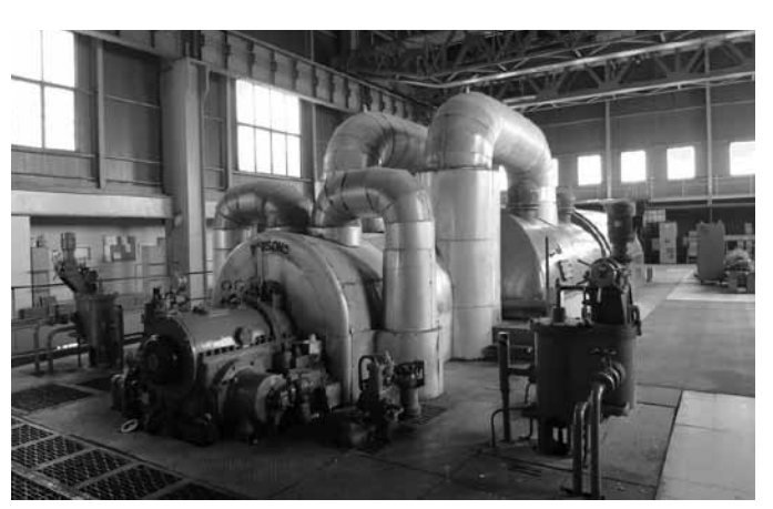
The Marsa Power Station was built in the 1950s with aid from the Marshall Plan.