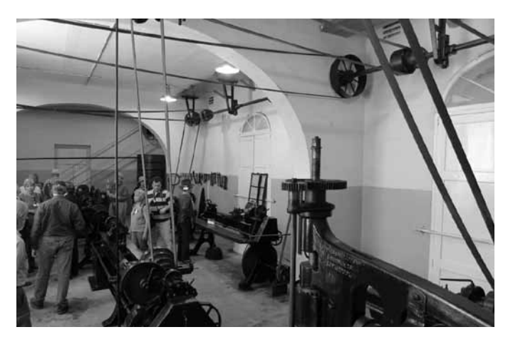
The workshops at the Vincenzo Bugeja Conservatory are complete to their original 1907 layout. The conservatory trained boys in the industrial arts.

Thursday's touring began with the Pembroke Reverse Osmosis (RO) Plant. RO of seawater supplies about 60% of Malta's potable water, the rest being groundwater or collected rainwater. About 54,000 cubic meters (14.3 million gallons) of seawater per day comes to the plant from wells at the edge of the sea. The primary filtration occurs in the porous rocks that the water must pass through even before it reaches the plant. At the RO Plant, pumps raise the pressure to 69 bar (about 1000 psi), and feed it into hundreds of seven-stage RO cartridges around 40 ft. long. The pressure drives fresh water through semipermeable membranes into a central collection tube, while increasingly salty residual water remains outside the tube. The residual water is still