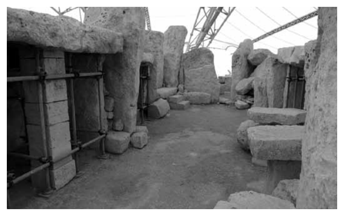
The temple of Hagar Qim (c. 3600–3200 B.C.) stands on a hilltop overlooking the sea. A massive tent protects the archeological site.