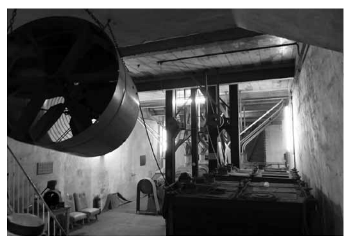
The Xemxija underground flour mill is one of eight such deeply buried mills built in the 1950s as part of improving Malta's ability to survive a war.

under high pressure, about 62 bar, and there is an energy recovery system using Pelton wheels (impulse water turbines) to recover this energy. The water makes its way to a central reservoir where it is blended with groundwater and finally treated with chlorine prior to distribution. Pembroke is one of three similar plants on the island; some hotels and businesses, such as Farsons (below), have private RO plants.