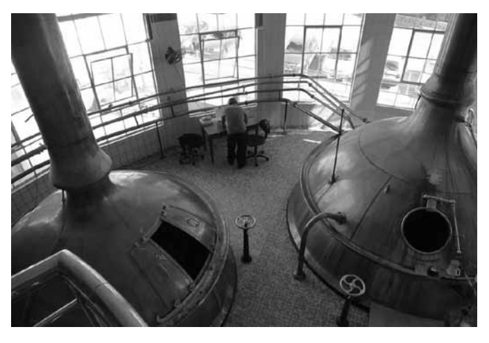
The copper brew kettles at Farsons Brewery.

The last stop was Ft. Rinella, one of two primary batteries that once defended the Grand Harbour (the other one