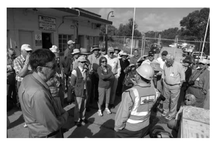
SIA's Malta Study Tour participants prepare to go underground at the Has Saptan underground fuel depot.